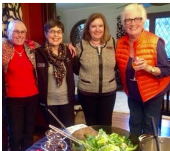
Reel Culture film group gals