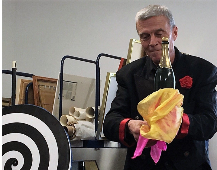
A wonderful magician at Tracey's shop