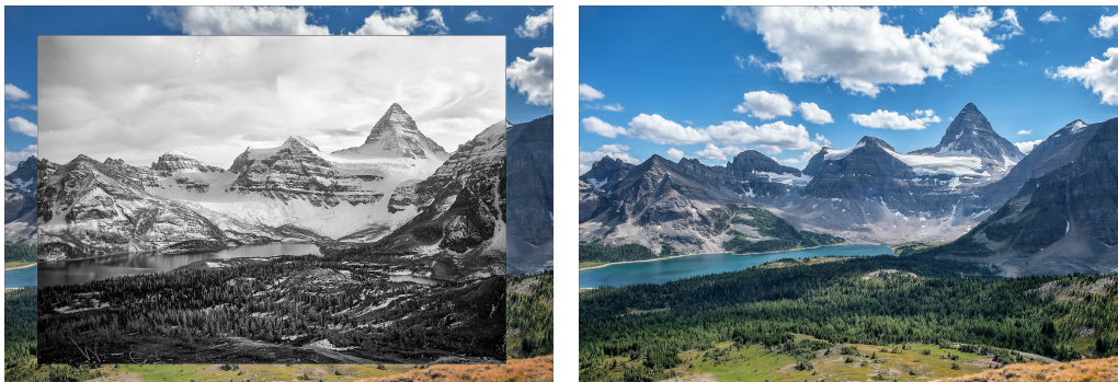
Mt. Assiniboine 1913 vs 2017

For 20 years the Mountain Legacy Project (MLP) has been using repeat photography to examine landscape level change in the Canadian mountain west. Using historical glass plate images taken from 1888 to 1950, MLP teams determine the location the images were taken from, go to the same place, and rephotograph them as accurately as possible. The historic and modern images are then aligned and analyzed for landscape-level change. The historic/modern image pairs are also made available for use by scholars, students, government agencies, the public at large – in fact, anyone interested in exploring Canada's mountain heights.