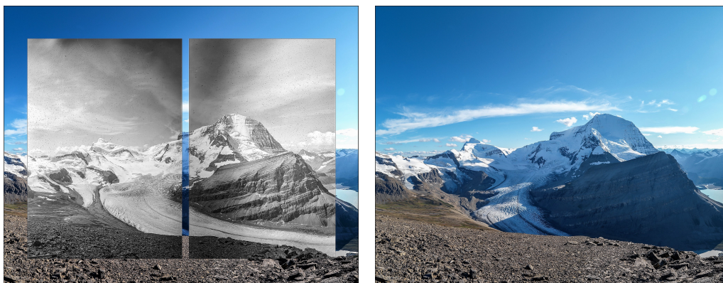
Mt. Robson 1911 vs 2011

This research is deeply interdisciplinary – environmental science, archival research, history, computer science, statistics – and that’s just some of the “academic” side of the house. Add on mountaineering, photography, wilderness travel, and helicopter training and the intricacies underlying the project become apparent. And, such a long-running photography project has a set of its own data wrangling issues that are non-trivial to deal with.