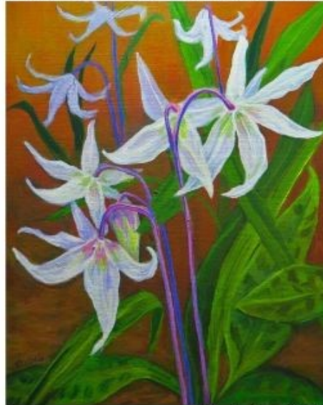
Painting by Terry McBride

TEMPORARY GYM, GLENLYON NORFOLK SCHOOL 1701 BEACH DRIVE, VICTORIA (OAK BAY)